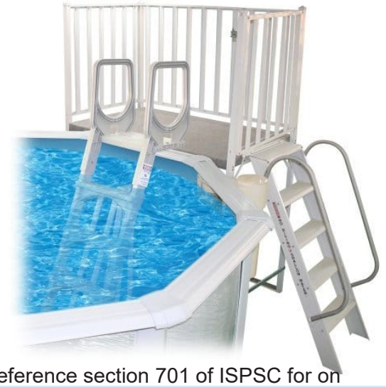
Reference section 701 of ISPSC for on ground pools

Where only the pool wall serves as the barrier, the bottom of the wall is on grade, the top of the wall is not less than 48 inches above grade entire perimeter of the pool.